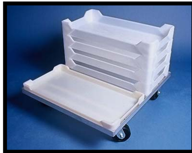
BB-8C and BB-1630-5C with BB-1630A-2UP dolly