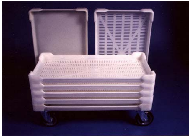
BB10-C and BB 10-V with BB-1630P-3 dolly

VENTED OR SOLID BOTTOM AIR-FLOW SANI-TRAYS ®