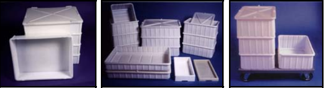
Self Stacking Bins & Boxes Seal without Lids