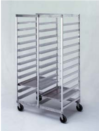
Custom & Standard Racks, Carts, Dollies & Casters