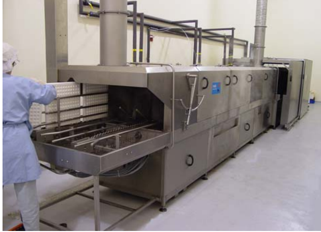
MAFO "Seamless" Tunnel Washing Machines