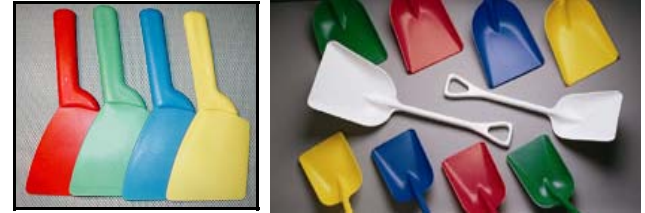
DS Series - 5-color scrapers, paddles & shovels