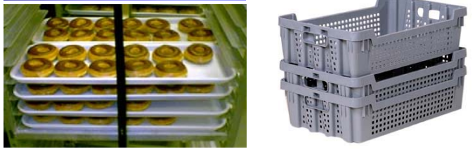
Stack and Nest, Sheet Pans, Nesting Trays