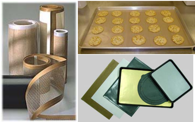
S2B Series - Ovenable Liners, Mats, Sheets Eliminate parchment paper, oils, packaging, cornmeal, flour, disposable and clean-up