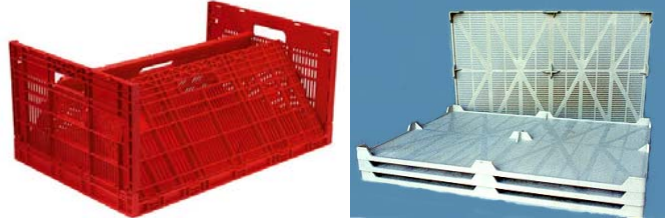
Collapsible Crates, Attached Lid Containers, Panning, Cooling & Drying Racks & Trays