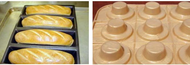
Shape2BAKE Series - Ovenable Teflon Moulds Flexible, non-stick, baking/freezing products