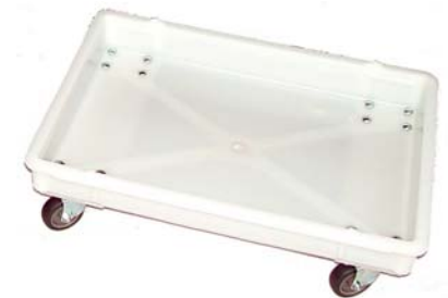
BB-1826P-3 Plastic Dolly

Weight ratings up to 1800 lbs. available.