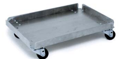
BB-1826AS-3 Aluminum Dolly