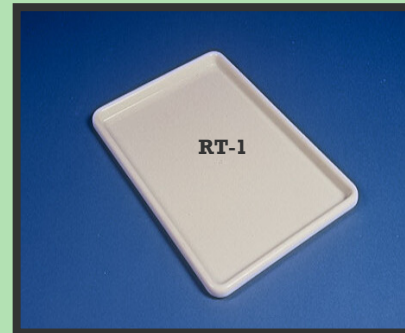
De-Boning & Freezing Pans