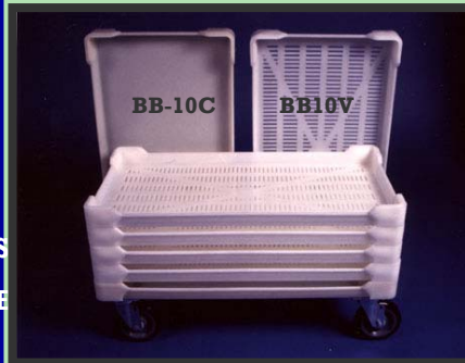
Self Stacking Vented Trays