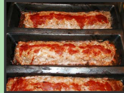
NEW - FLEXIBLE HI-TEMP MOLDS, PANS AND LINERS (Meatloaf baked in Shape2Bake® Baguette mold)