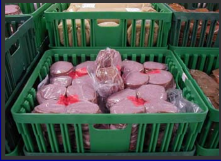
VENTED STACK AND NEST SN-2024-8