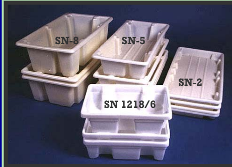
Stack and Nest Tubs